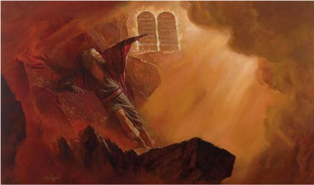
Arnold Friberg, Giving of the Law