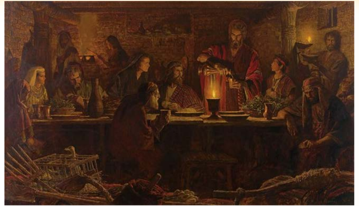
Arnold Friberg, First Passover

• “And thus shall ye eat it; with your loins girded, your shoes on your feet, and your staff in your hand; and ye shall eat it in haste: it is the LORD’s passover. For I will pass through the land of Egypt this night, and will smite all the firstborn in the land of Egypt, both man and beast; and against all the gods of Egypt I will execute judgment: I am the LORD. ” (12:11–12)