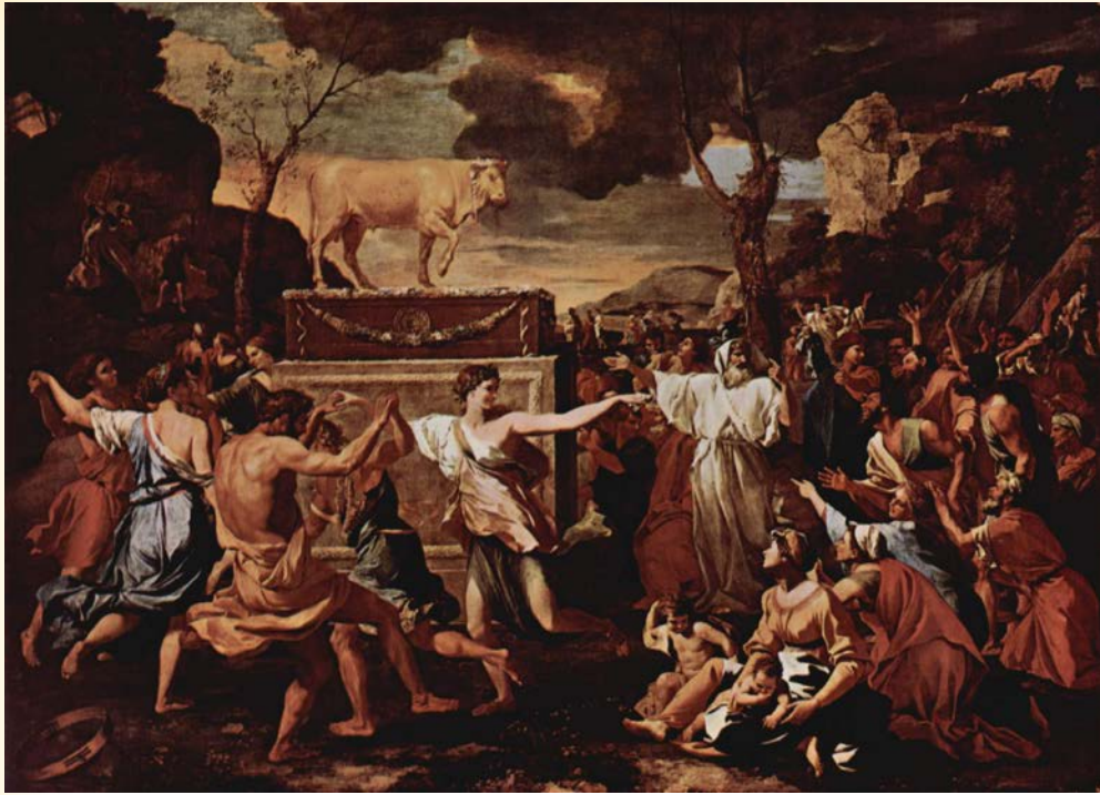
Nicolas Poussin, The Adoration of the Golden Calf